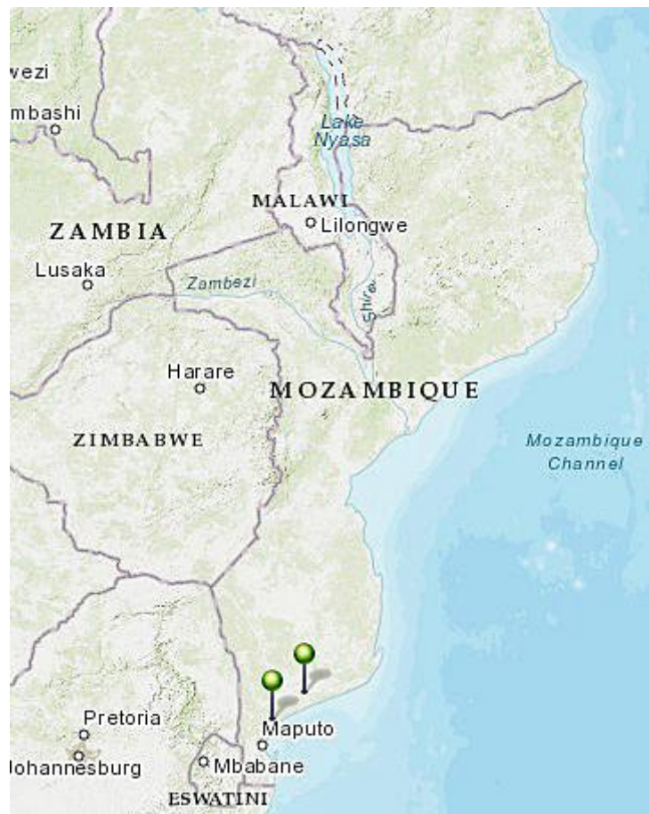
Figure 1. Location of the polders in Mozambique

The pictures by Prof. Adriaan Volker are shown in Table II.